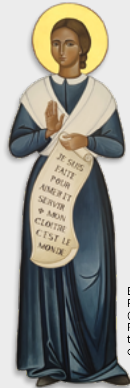
Blessed Pauline Jaricot (1799-1862), Founder of the Propagation of the Faith (1822).

Thank you to all our benefactors who contributed to our fundraising campaigns.