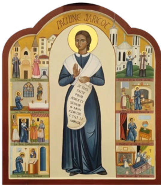
Blessed Pauline Jaricot