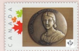
Limited edition souvenir stamps from Canada Post to commemorate the beatification of Pauline Jaricot on May 22, 2022.

Thank you to all our benefactors who contributed to our fundraising campaigns.